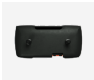
Integrated screws 50mm