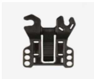
Snap-in railsbracket 50mm