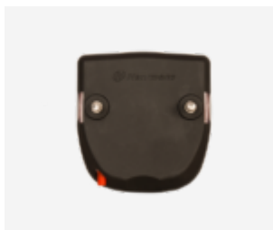
Integrated screws 50mm